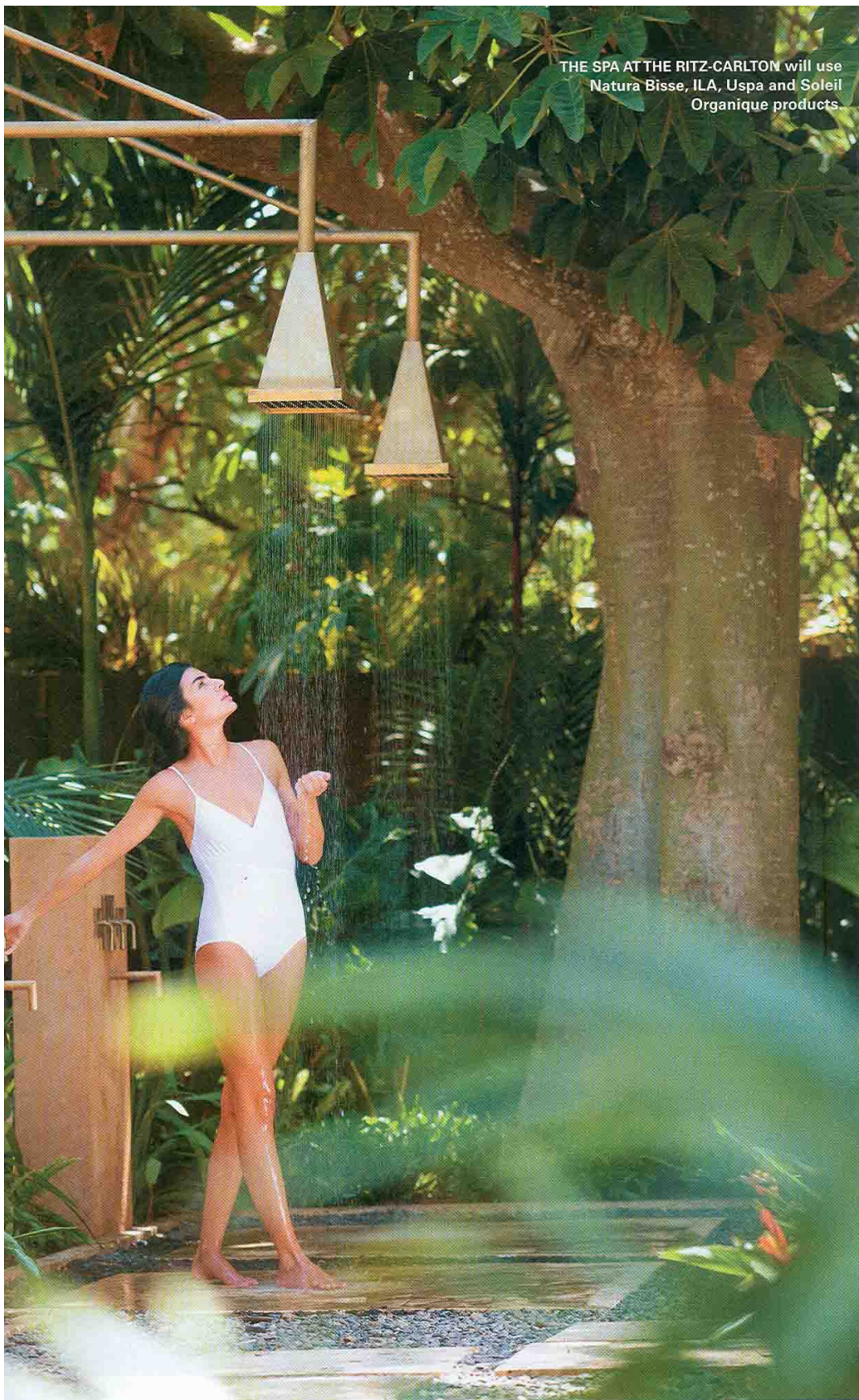
THE SPA AT THE RITZ-CARLTON will use Natura Bisse, ILA, Uspa and Soleil Organique products